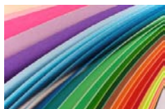
Copy & Business Papers