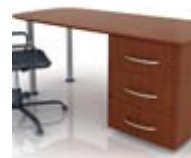
Furniture Desks, Files, Chairs and more!