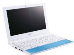
Laptops, Desktops & Tablets