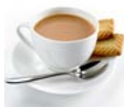
Coffee / Tea Room Supplies