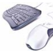
IT Consumables & Peripherals