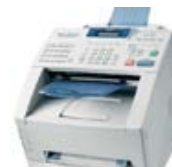
Printers, Copiers, Multifunction Devices