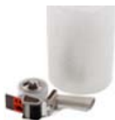
Packaging & Mailing including Postage Paid