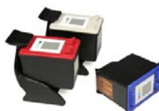
Inks & Toners